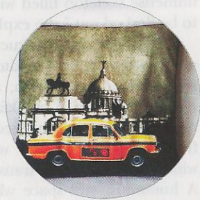
Cushion cover, ₹ 600, by Eco Corner