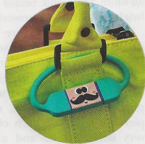
USB flash drive, ₹ 580, by Kya Cheez Hain