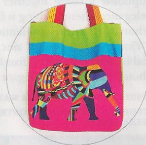
Elephant bag, ₹ 1,150, by Quirk Box